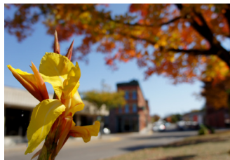
Fall Colors, Bridge Square by Griff Wigley